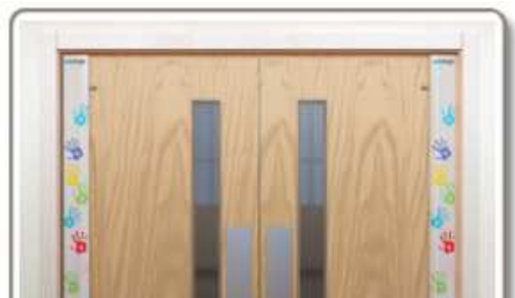
AluSlide finger guards.

In heavy duty environments plastic guards may need replacing within 6 - 24 months of installation whereas this guard will perform as intended for years.