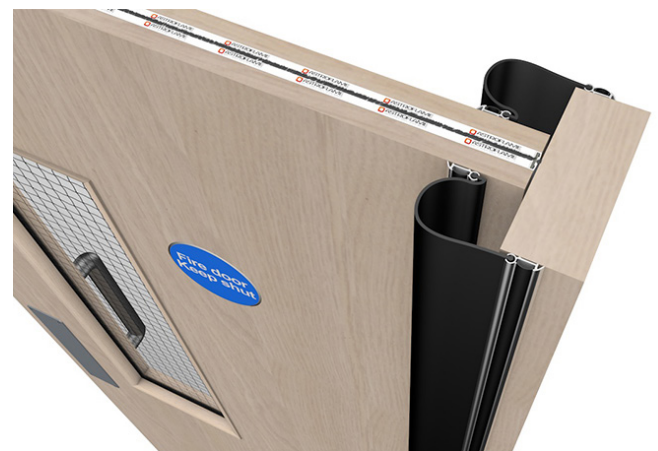
Pivot Door Installation