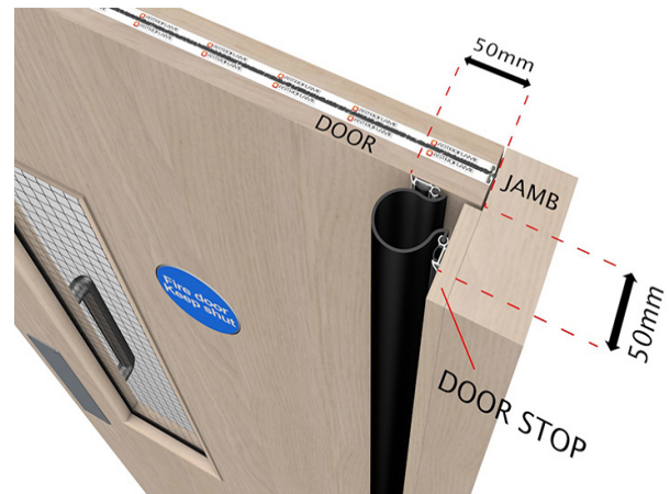
Hinged Door Installation