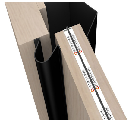
Astro FingerKeeper Rearguard standard shown on an opened door