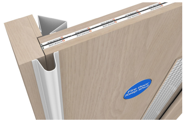
Astro FingerKeeper Rearguard standard shown on a closed door